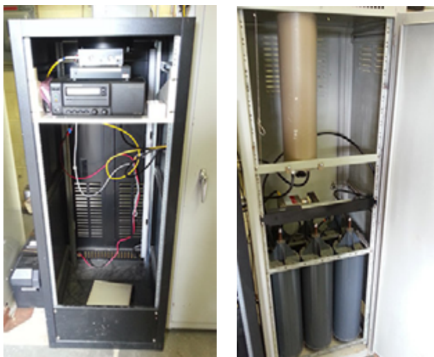
Progress on the 145.37 MHz repeater site. Rack on left contains repeater, controller, and control link receiver. The hardware will be replaced with Fusion repeater, new controller and link transceivers. Rack on right is the duplexer, isolator and in band filter.