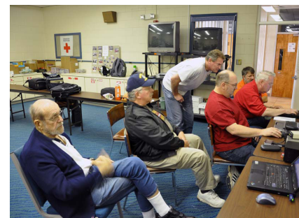
Gathering of IRARC members to learn about digital communications (RTTY, PSK-31) during the ARRL RTTY Round-Up on Jan 8th at the IRARC club station