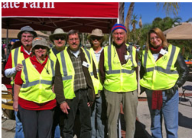
The MS 2011 Walk Public Service Amateur Radio Team - A fantastic joint effort between Indian River Amateur Radio Club and PCARS.