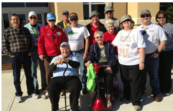
The combined IRARC and LISATS team supporting the 2013 MS Walk at the Church of Viera campus.