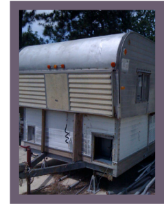
Front view of IRARC Trailer. Photo taken in May 2010. Note openings in lower front.