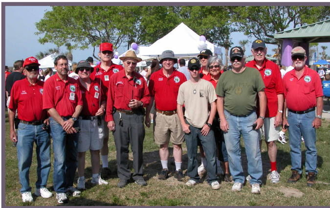
IRARC volunteers assembled at Jetty Park in Cape Canaveral for the 2010 March of Dimes Beach Walk on April 24, 2010. This was the third public service event of the year.