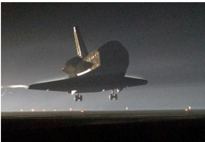
Space Shuttle Atlantis makes its final landing on July 21, 2011 at 5:57 AM closing out the Space Shuttle Program. Did you work the N4S special event station for the last flight of Atlantis? Be sure to submit your QSL card for credit.