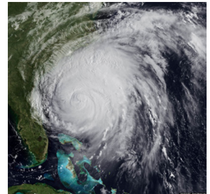
Cat 3 Hurricane Irene off Florida coast moving up the Eastern Seaboard - 25 Aug 2011.

potential shelter activation and radio operator deployment 120 hours before a predicted impact when the models indicated Florida could be the hurricane's target. Were you ready for the event? Now we are just entering the peak of the hurricane season, be sure to have your insurance, personal inventory, shelter and evacuation plans ready just in case the next hurricane is not a practice exercise but the real deal.