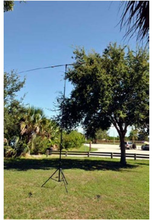
A trifecta of buddipole antennas set up at Kiwanis Island for the Space Coast QRP meeting on September 21st. From left to right: Vertical arranged antenna used by Sandy, AF4BZ, Vertical Vee antenna used by Greg AB4GO on 20 meters and a 17 meter dipole used by Dave Lerret, KU0R. Dave had good success working 17 meter CW QRP with contacts into Columbia, England, and Belarus.