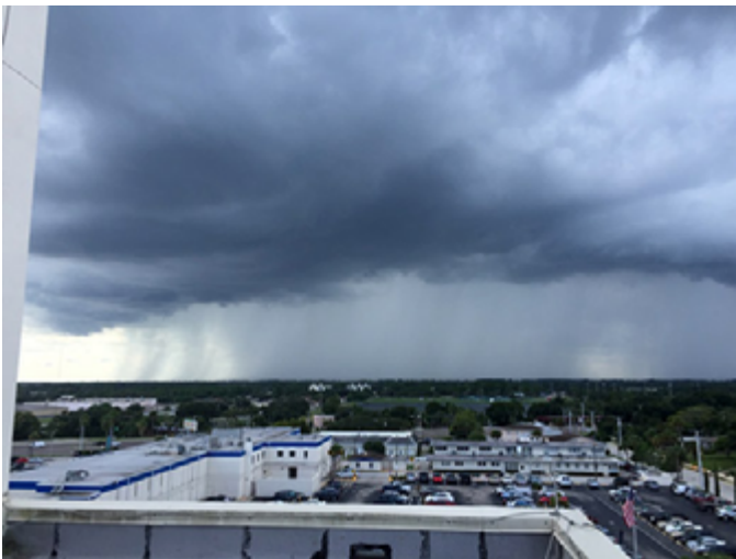
Stormy weather moving in during the 88 Repeater antenna replacement on the roof at Wuesthoff Hospital in Rockledge