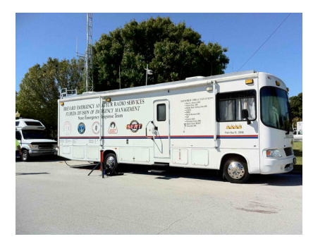
BEARS One vehicle on display at the 2010 ported by IRARC and other local radio clubs.

ganizations. The cost for individuals to tailgate or obtain a table for sales will be $10. Regular attendee admission is $3. Hamfest talk-in will be on 147.135 MHz + (no PL tone). BEARS is looking for individuals or clubs to volunteer in hamfest related tasks and make this a successful endeavor. Contact Mike Stallings, K4RVR, 636-3619, k4rvr@arrl.net or visit http:// October Melbourne Hamfest. BEARS is supbears.homelinux.net/index.html.