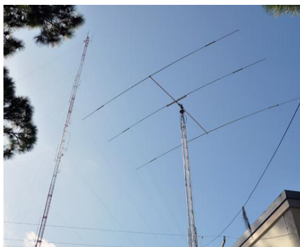
IRARC's three-element beam pointed toward Europe on a beautiful fall day for the CQ WW SSB Contest - note the 300 foot tall Brevard EOC antenna tower in the background.

IRARC members joined forces to participate in the CQ World Wide DX contest on 20-30 October at the Rockledge club station. The contest purpose was simple - contact other amateurs around the world in as many zones and countries as possible. Using the club call sign, AJ4IR, two transceivers were used by club members to enjoy a wide open HF contest where DX was the rule and the